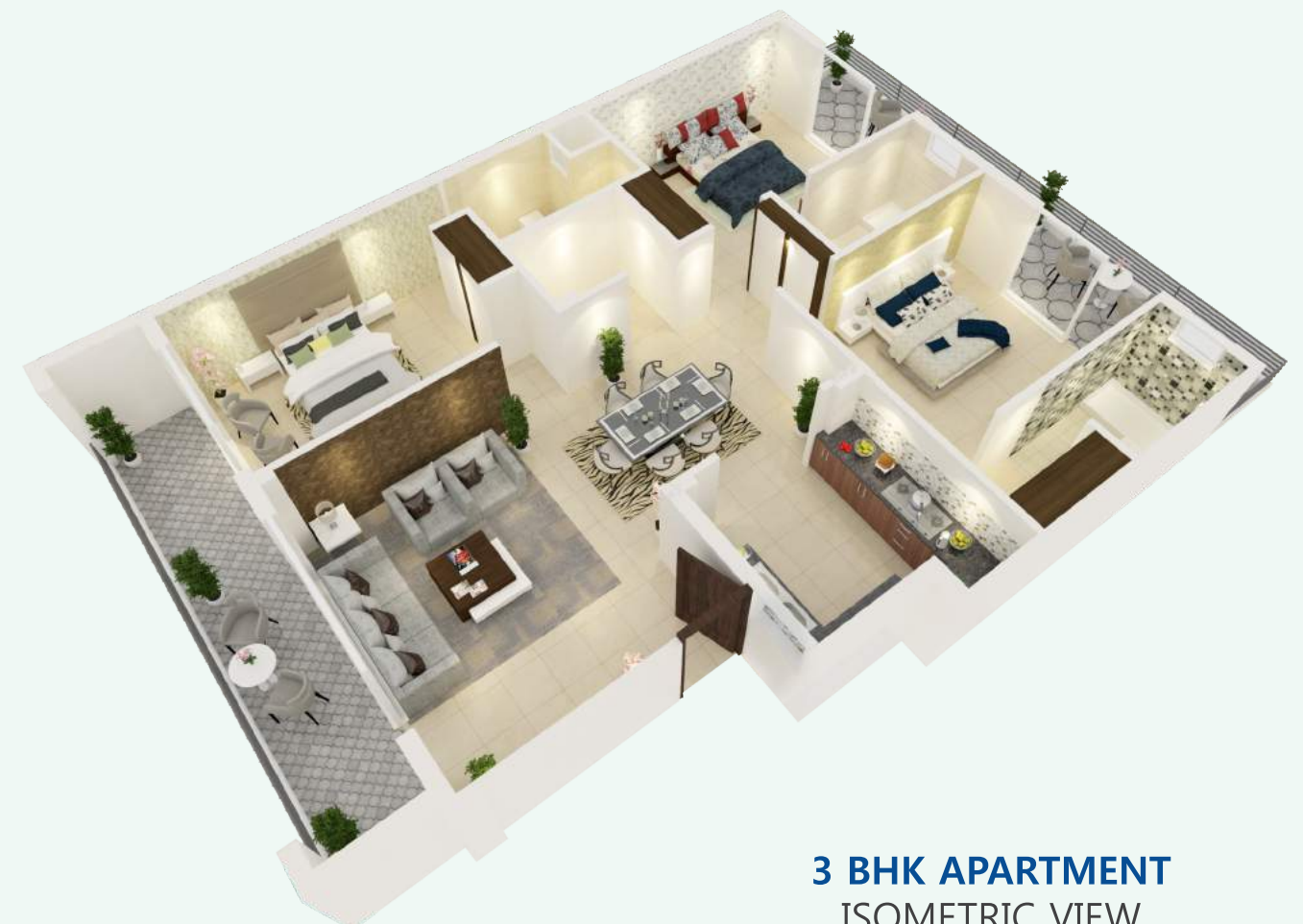
3 BHK APARTMENT ISOMETRIC VIEW