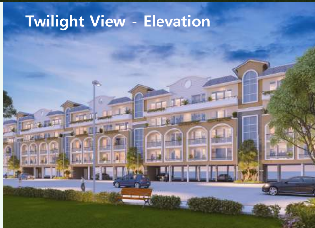
Twilight View - Elevation