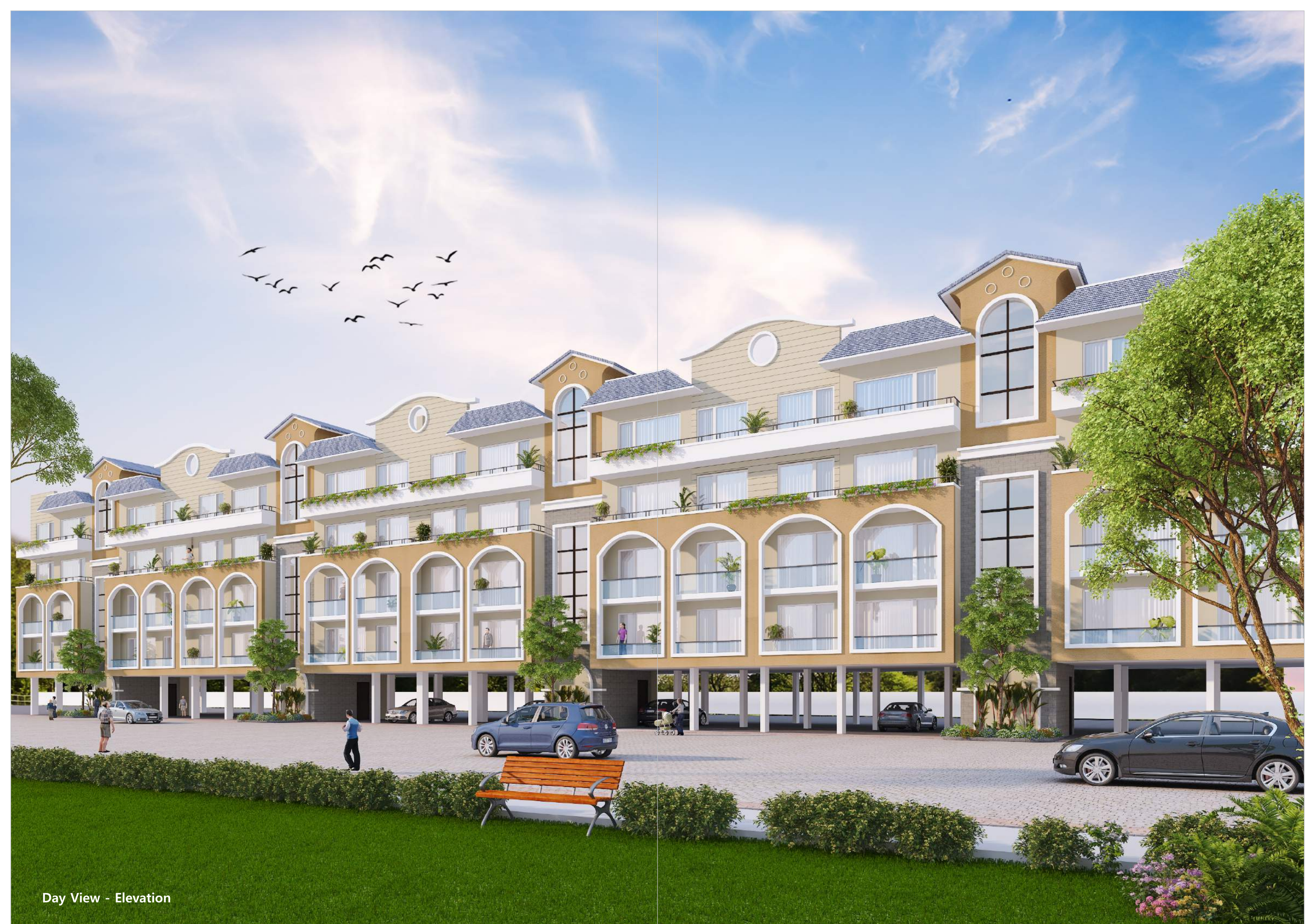
Day View - Elevation